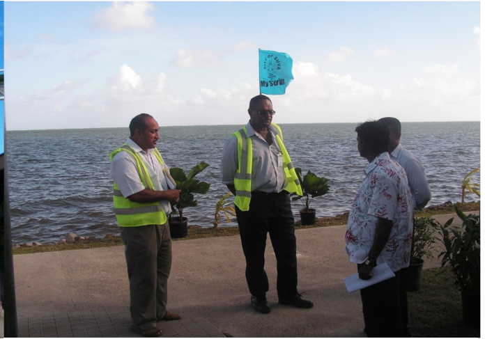
Construction of Sea Breeze Walkway