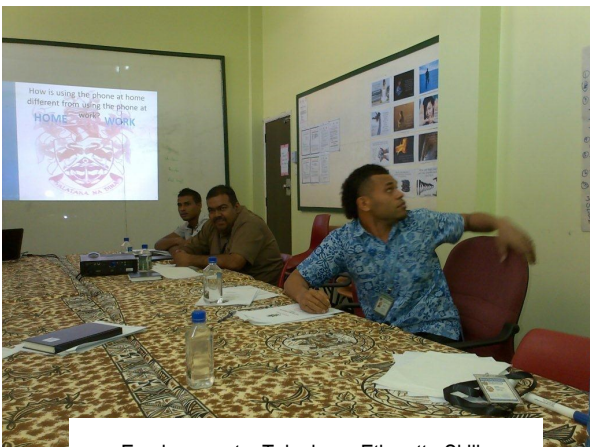
Employees at a Telephone Etiquette Skills workshop