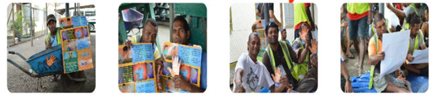
"We will help Eliminate Violence Against Women and Girls and make our streets safer" Wheelbarrow boys, a project funded by Pacific Ending Violence Against Women Facility Fund.