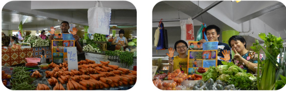
"We want a violence free market" Suva market vendors