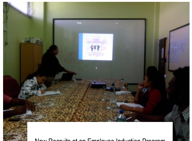
New Recruits at an Employee Induction Program