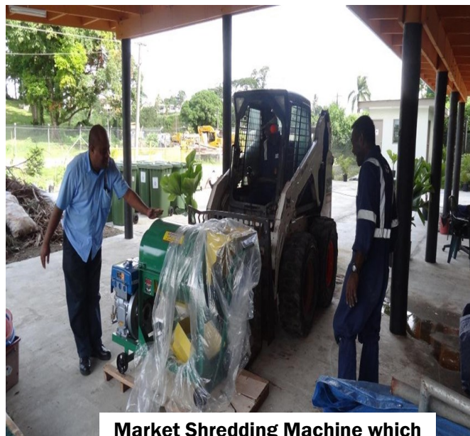
Market Shredding Machine which was purchased by the Council

The Health Department's Sanitation team ensures that all Food Outlets are hygienic and prepare food in a safe and hygiene environment.