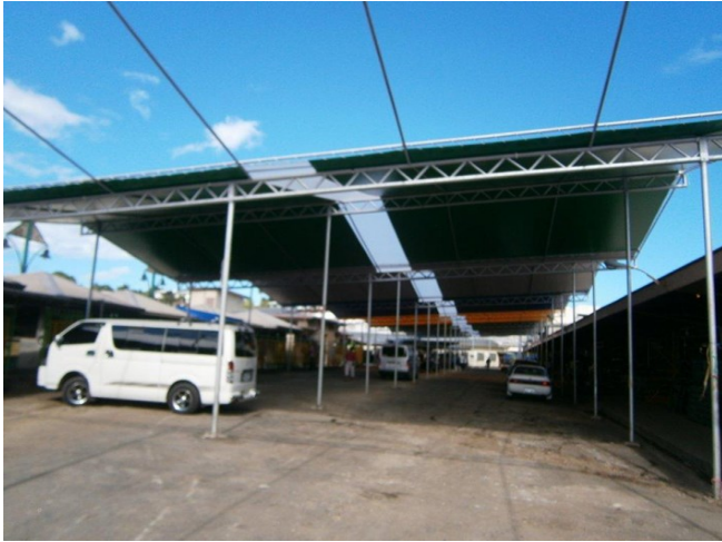
Weekend Vendors Market Shelter