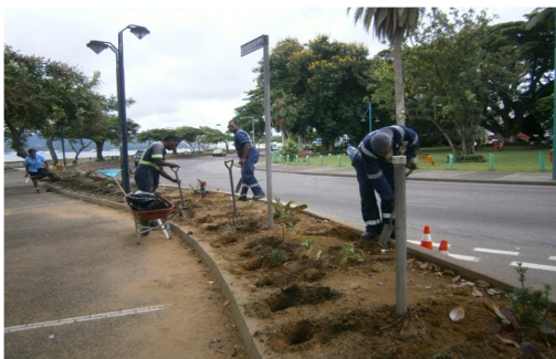
Landscaping at Stinson Parade