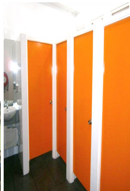
Curio Handicraft Toilet Renovation