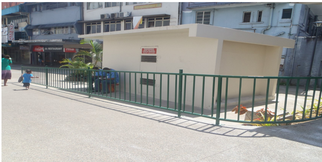
Disabled Friendly Footpaths