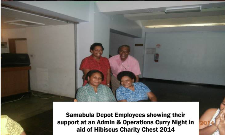
Samabula Depot Employees showing their support at an Admin & Operations Curry Night in aid of Hibiscus Charity Chest 2014