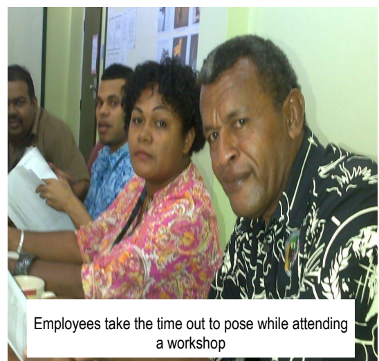
Employees take the time out to pose while attending a workshop