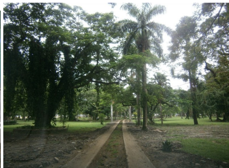
Thurston Garden Levelling