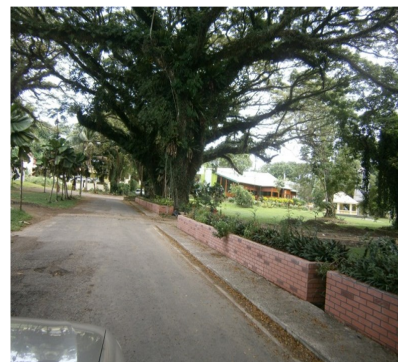
Thurston Garden Landscaping— Entrance to Museum