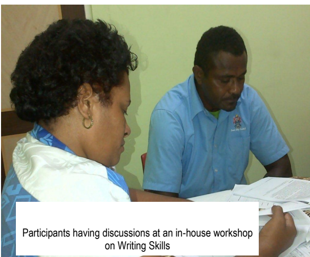
Participants having discussions at an in-house workshop on Writing Skills