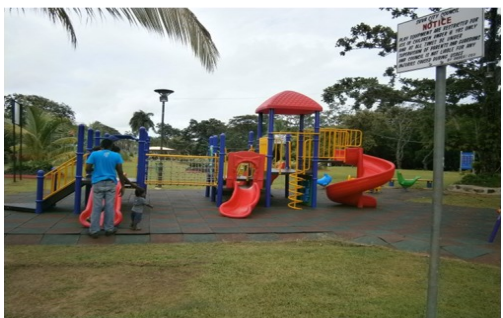
New Play Equipment at My Suva Picnic Park