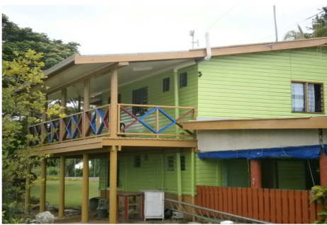
Muanikau Police Post Terrace Extension